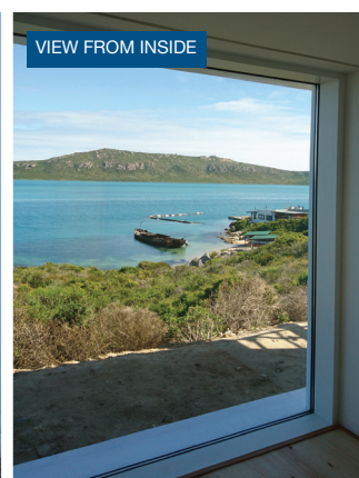
Envirotherm 2 DG