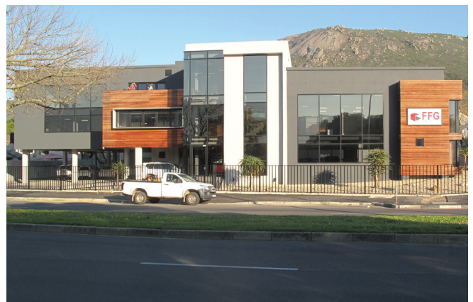
FFG Head Office, Paarl