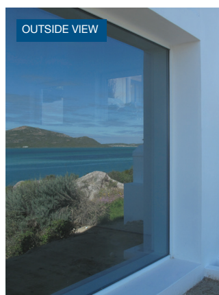
House: Penguin Place, Langebaan