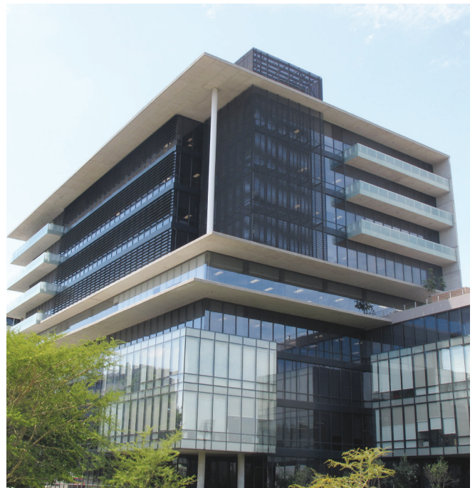
Santam Office, Tyger Valley, CPT

MIN 250 x 250m TO 3000 x 2000m SUBJECT TO SANS 10400-N AND 10137 COMPLIANCES